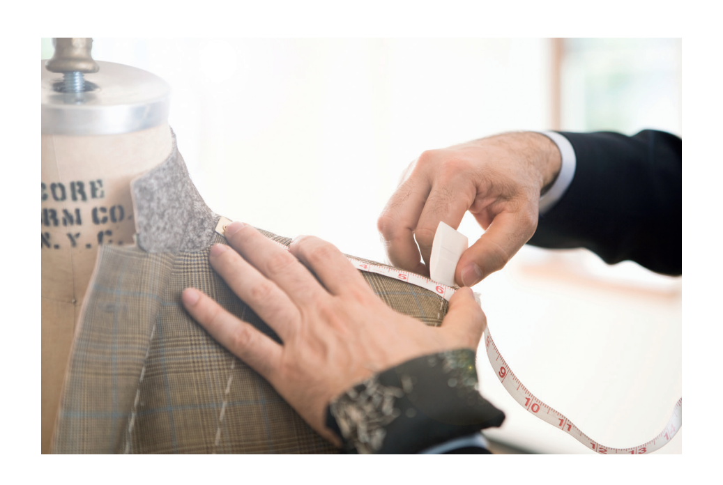
We aim for continuity. You can maintain your relationship with your trusted advisor. Our established expertise in life insurance best complements your carefully defined wealth planning.